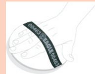
Eagle IPC Band (Interface Pad Conversion Band) No. 00463 $3.56 Each