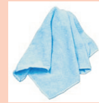
Eagle Micro Finishing Detailing Cloths Part No. 04161 $4.06 Each