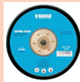
Eagle Super-Tack 6" Disc Pad Low Profile Part No. 01406 $24.99 Each