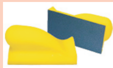
Eagle Stickon Foam Hand Sanding Block (1/3 Sheet) Part No. 00102 $11.20 Each