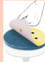
Eagle Super-Tack Interface Pads 5" Part No. 04530 $9.05 Each 6" Part No. 04631 Dustless $10.59 Each