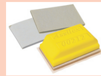
Eagle Super Assilex Foam Block Part No. 00212 $12.86 Each