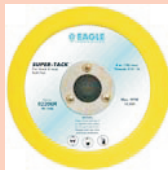
Eagle Super-Tack 6" Disc Pads Part No. 02206R $20.49 Each Part No. 02266R (Dustless) $24.24 Each